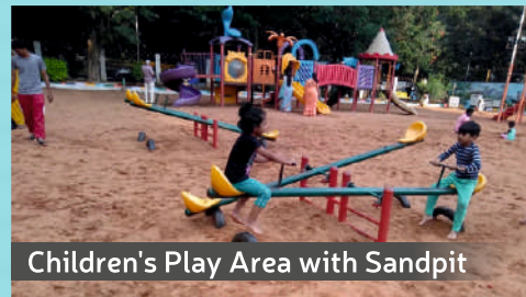
Children's Play Area with Sandpit