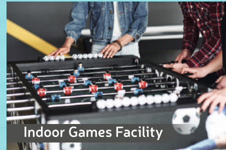
Indoor Games Facility