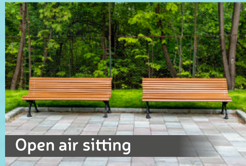
Open air sitting