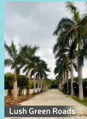
Lush Green Roads