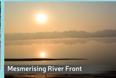
Mesmerising River Front