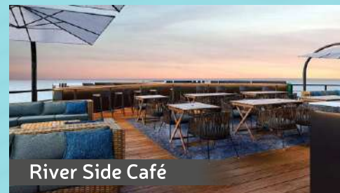
River Side Café